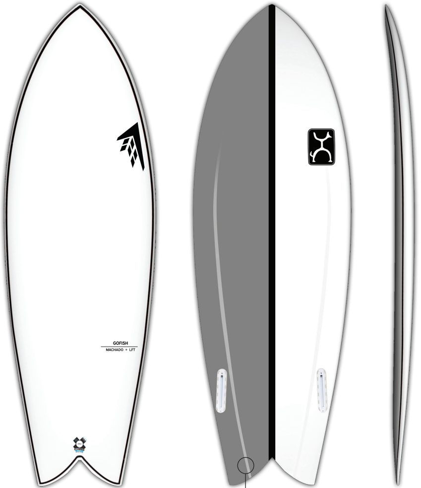
To show bottom contours only | Not actual color

The overall effect of these design parameters, when combined with a keel fin set up, is a highly maneuverable and speedy board with tons of drive and takes the retro fish to a whole new performance level.