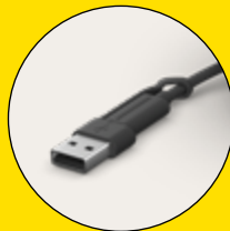
USB C and USB A connectors included