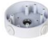
PFA139 Junction Box