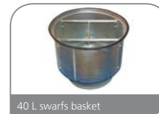
40 L swarfs basket