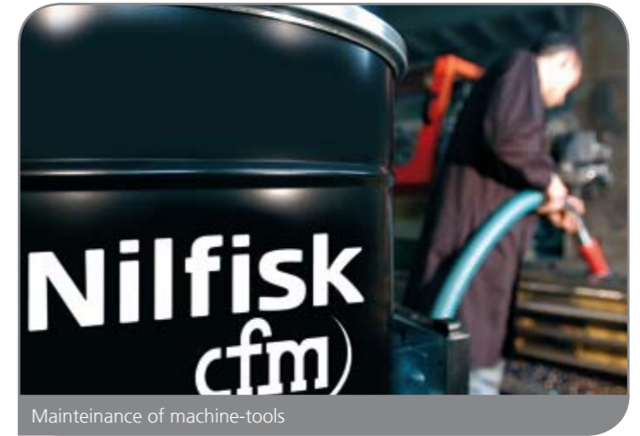
Maintenance of machine-tools