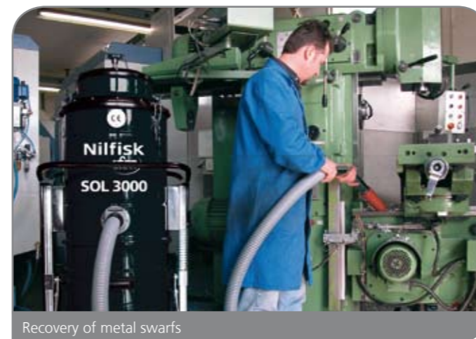
Recovery of metal swarfs