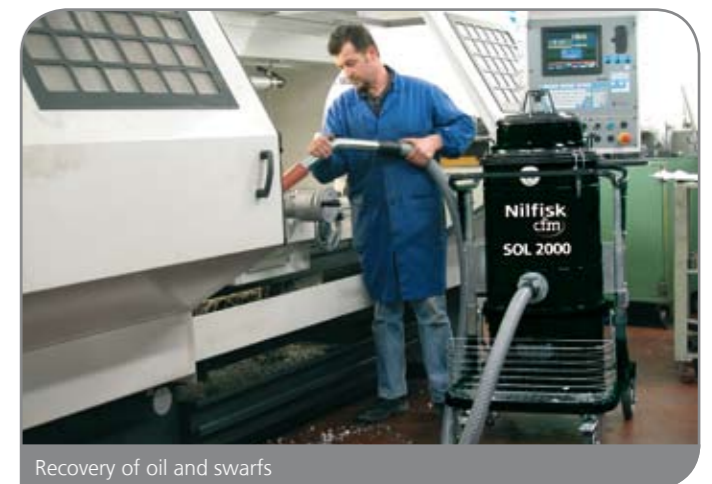
Recovery of oil and swarfs