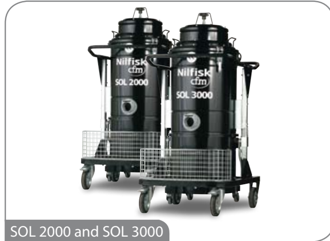
SOL 2000 and SOL 3000