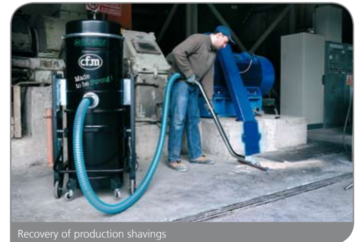
Recovery of production shavings