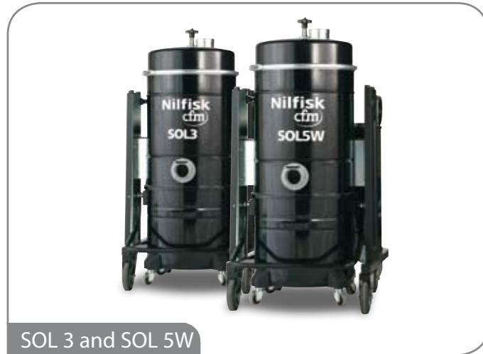
SOL 3 and SOL 5W