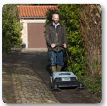
Robust design ideal for indoor and outdoor cleaning in limited space or congested areas, such as warehouses, small factories, retail stores, schools, garages etc.