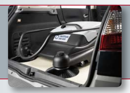
The handle can be folded without tools for storage and easy transportation