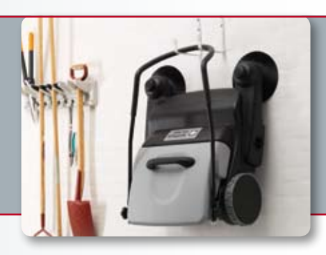
Cleaver handle/hopper construction keeps the hopper in place even when stored in the upright position or hung on a wall