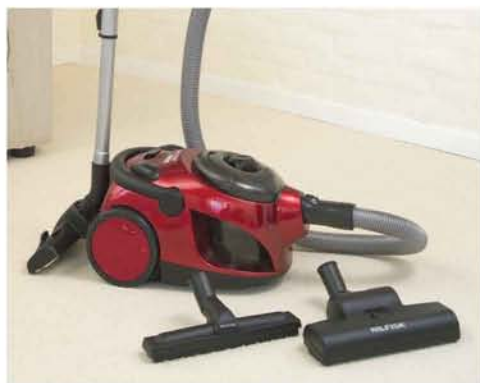
EXTRA NOZZLES - TURBO AND HARD FLOOR NOZZLES