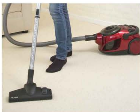
STRONG SUCTION - 2200W MOTOR FOR AN EXCELLENT CLEANING RESULT