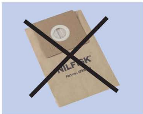
BAGLESS TECHNOLOGY - EASY AND POWERFUL TO USE